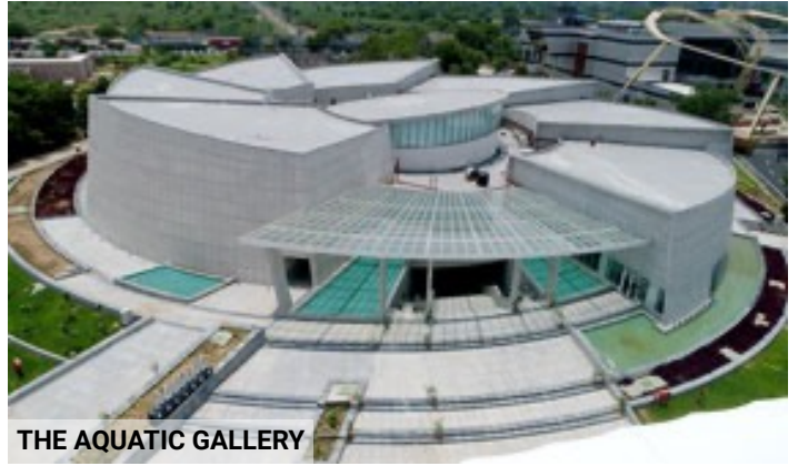
THE AQUATIC GALLERY