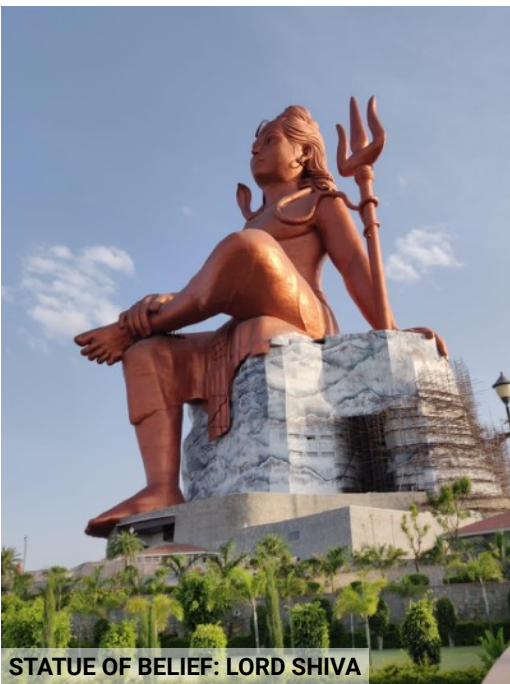
STATUE OF BELIEF: LORD SHIVA