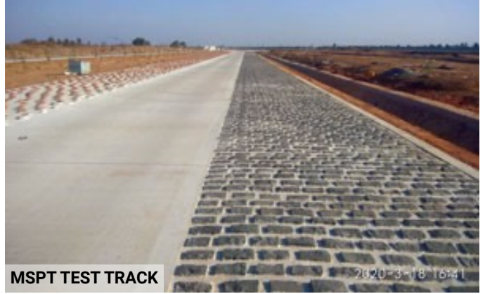
MSPT TEST TRACK