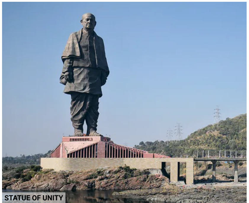
STATUE OF UNITY