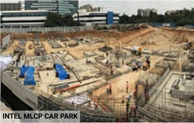
INTEL MLCP CAR PARK