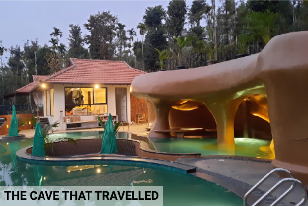
THE CAVE THAT TRAVELLED