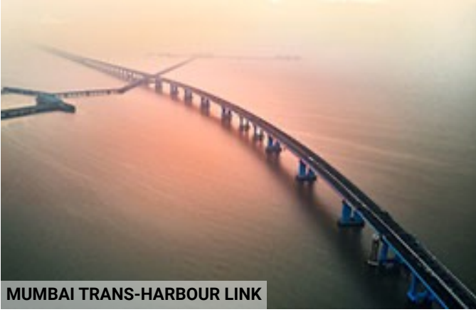
MUMBAI TRANS-HARBOUR LINK