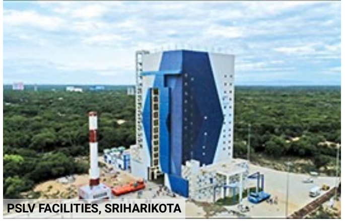
PSLV FACILITIES, SRIHARIKOTA