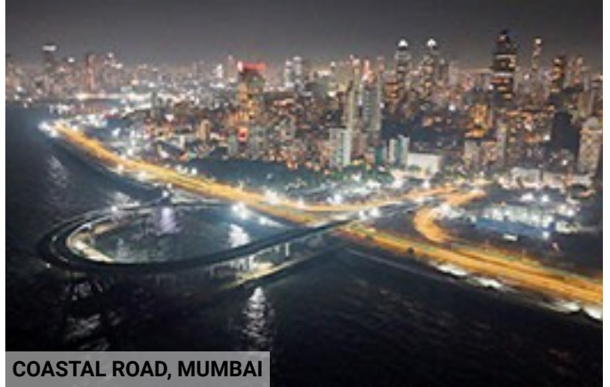
COASTAL ROAD, MUMBAI