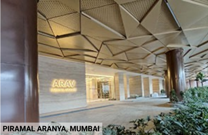
PIRAMAL ARANYA, MUMBAI